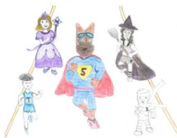
FROM ADDICTION 2013